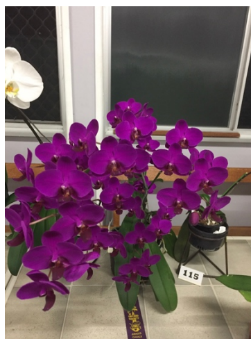
Phal. Sinica Sunday