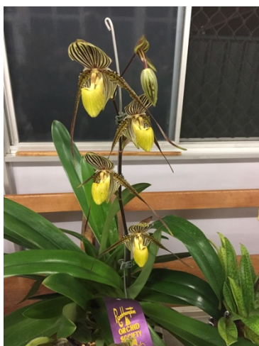
Paph. Saint Swithin ‘Ellie’